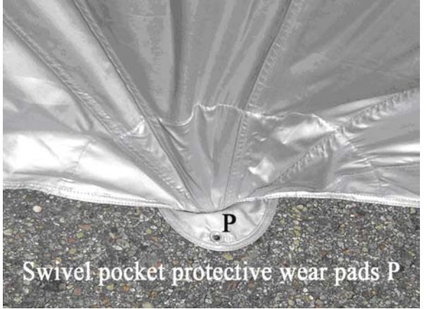
Protective Wear Pads:

After assembling the CycleShelter, make sure the Hinge Pocket Protective Wear Pads (P) on both sides of the shelter are facing outward as illustrated in the picture, to protect from excessive wear. Warranty voided if not set up as shown. <u>Note:</u> Material (P) may vary from picture.